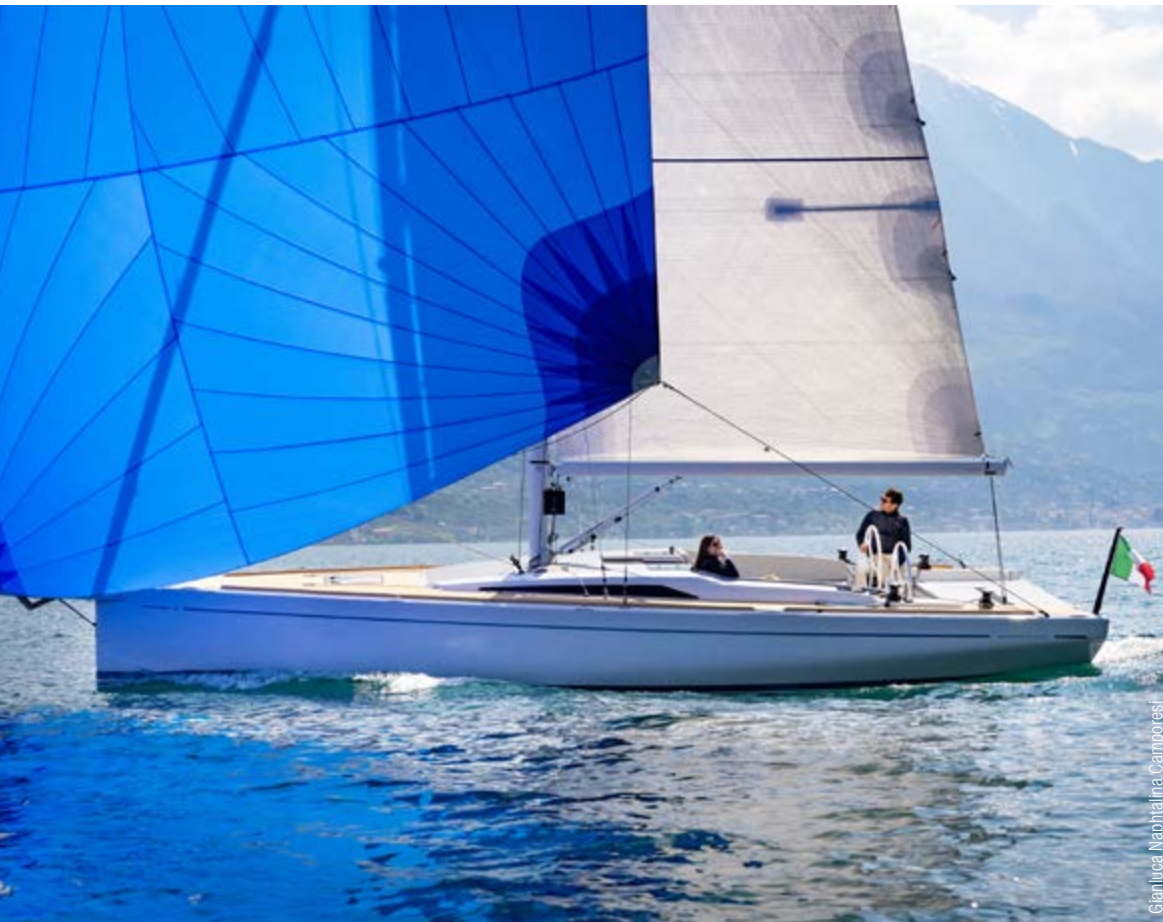
Gianluca Nephthalina Camporesi

or carbon fibres for reuse or eco-responsible disposal. A smart design approach enables the straightforward separation of boat accessories and components, emulating end-of-life practices in the automotive industry. This critical process guarantees that every component of the GS Blue can be effectively disassembled and recycled, thereby minimising environmental impact.