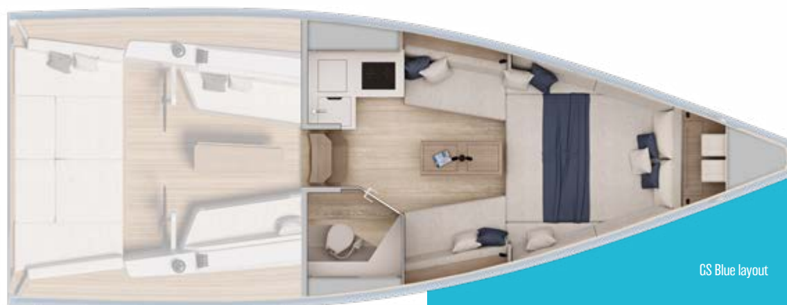
GS Blue layout

The Grand Soleil Blue is a forward-thinking day sailer that offers a zero-impact sailing experience. It comfortably accommodates up to 4 people overnight and is intended for use as a weekender. At the end of its life cycle, the boat is entirely recyclable, with every