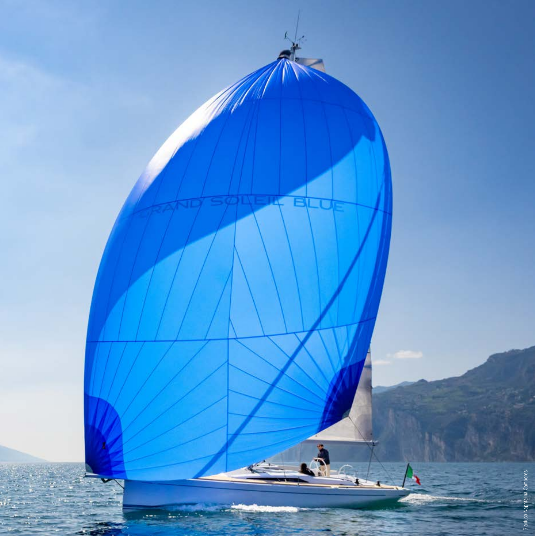
Gianluca Napolitano - Camporesi