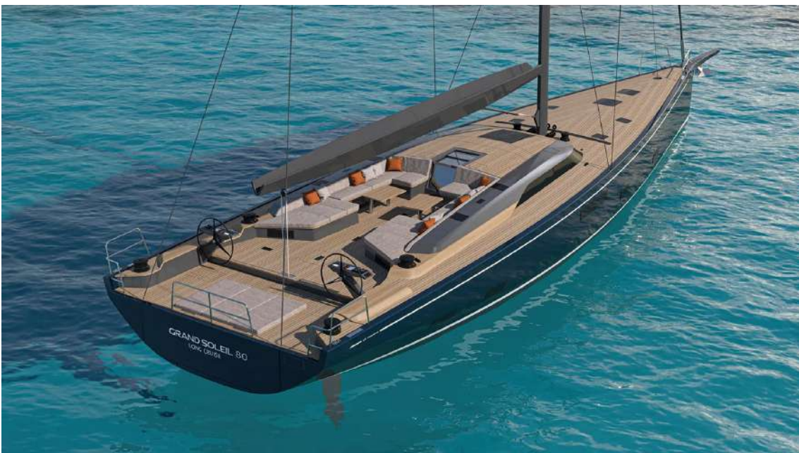
The Grand Soleil Plus 80 Long Cruise has twin rudders, a telescopic keel and a raised saloon

Grand Soleil's Plus line of yachts over 18 metres has a new flagship. At a smidge under 24 metres, the 80 is offered in Long Cruise or Performance