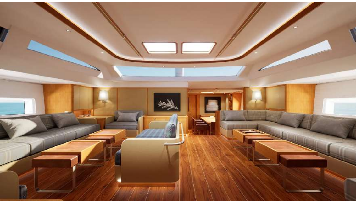
Touching water for the first time in mid-May, the Swan 128 features an elevated saloon with light filtering in on three levels, and an owner's cabin forward that includes a full-width en suite

Naval architect Germán Frers led the performance-focused design, refined through CFD analysis to ensure optimised hull shape. Its dual rudder system and a generous sailplan offer responsive handling and sailing speeds predicted to exceed 17 knots, while the moderate heel angle helps with comfort under sail.