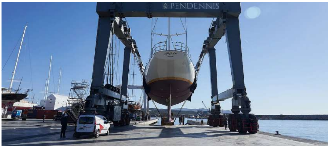
Halekai in the hoist at Pendennis Vilanova

It's a good thing Pendennis has two facilities – one in Falmouth, UK, specialising in major engineering works, complex refits and bespoke new builds, and another in Vilanova, Spain, which offers seasonal flexibility and high-capacity services. The 2024/25 winter season was one of the busiest, with both operating at capacity. More than 40 sailing yachts passed through for significant refits.