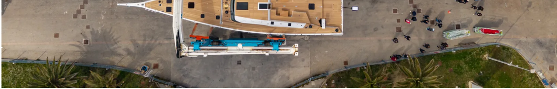
Hull one of the GS Plus 80 LC is without a tender garage, instead her owners opted for additional usable space for freezers or washing machines

"The launch of this first GS Plus 80 LC represents a significant moment for Grand Soleil, as the new flagship of our fleet takes to the water, representing not just the next generation of the line but also the zenith of the handcrafted excellence that our dedicated shipyard team is known for," added Marcello Veronesi, CEO of Cantiere del Pardo. "To share this moment with the owner and his family is a real honour, and it serves as a mark of more great things to come both for this yacht and for our Plus line facility here in Fano."